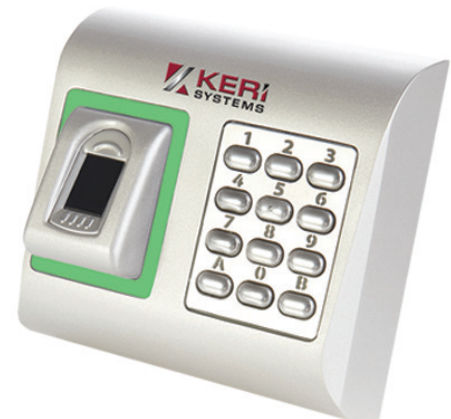
KBF-3KP BioSync Fingerprint + PIN