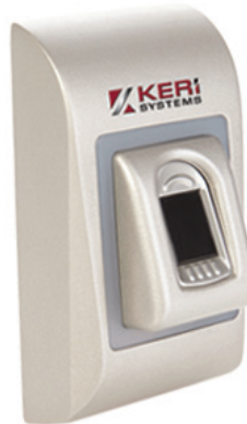
KBF-1FP BioSync Fingerprint-only