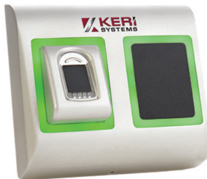
KBF-2PR BioSync Fingerprint + Proximity